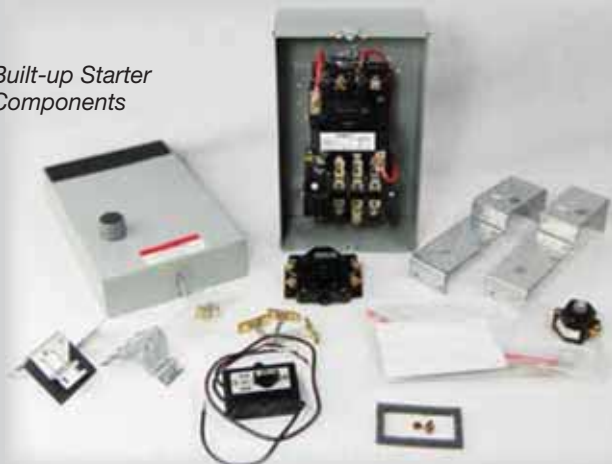
Built-up Starter Components

Even with good communication, problems can occur when "built-up" starters use mismatched, incomplete or poor quality components.