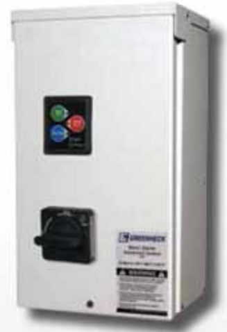
Model MSAC shown with optional disconnect switch