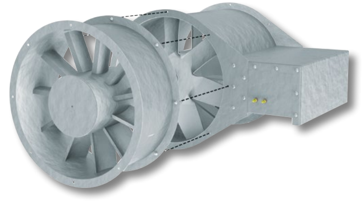
Model VTFBD Vaneaxial Fan