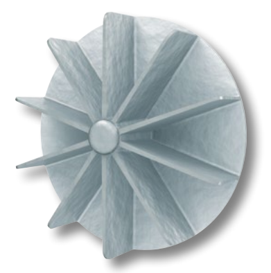
Radial Bladed Fiberglass Wheel