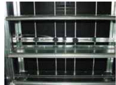
Pressure Pick-Up Tubes