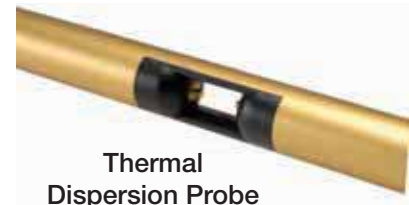
Thermal Dispersion Probe

The probes utilized on our AMD-TD series maximize the accuracy of the airflow measurement system. Other thermal dispersion probes utilize nodes with sharp edges around the opening that can create turbulence resulting in airflow measurement inaccuracy. The nodes in the AMD-TD thermal dispersion probes utilize a highly engineered injection molded aperture that straightens the airflow as it passes over the thermistors to produce an accurate measurement.